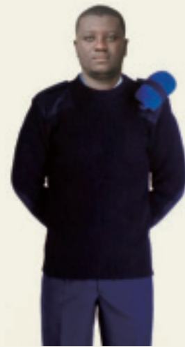
FD © -018