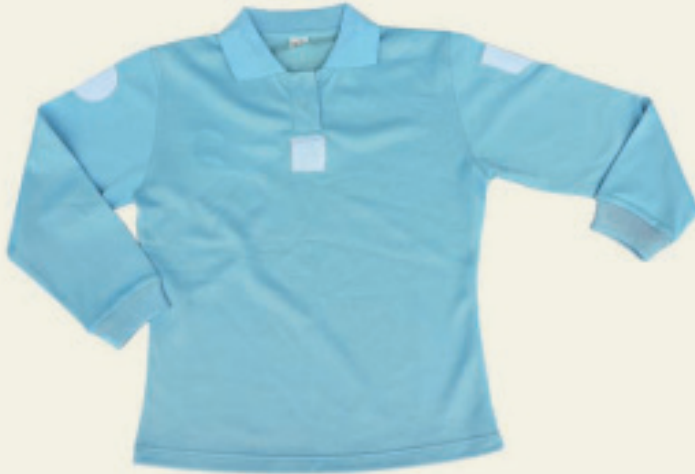
FD © -010