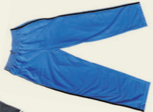
FD © -012