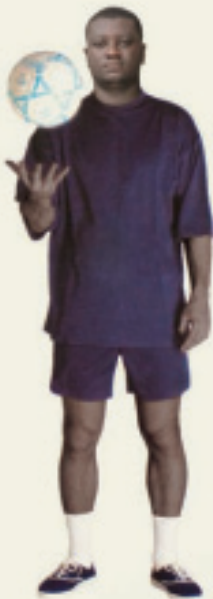
FD © -013