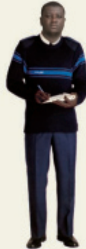
FD © -017