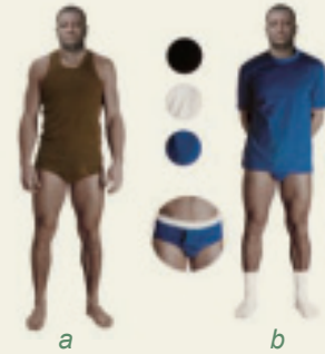
FD ® -027