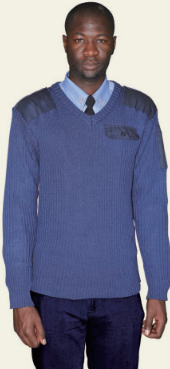
FD © -016