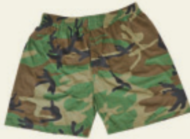
FD ® -026