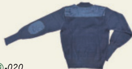
FD © -020