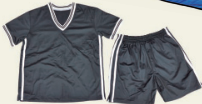
FD © -014