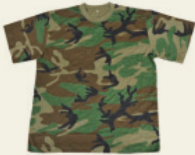
FD ® -025